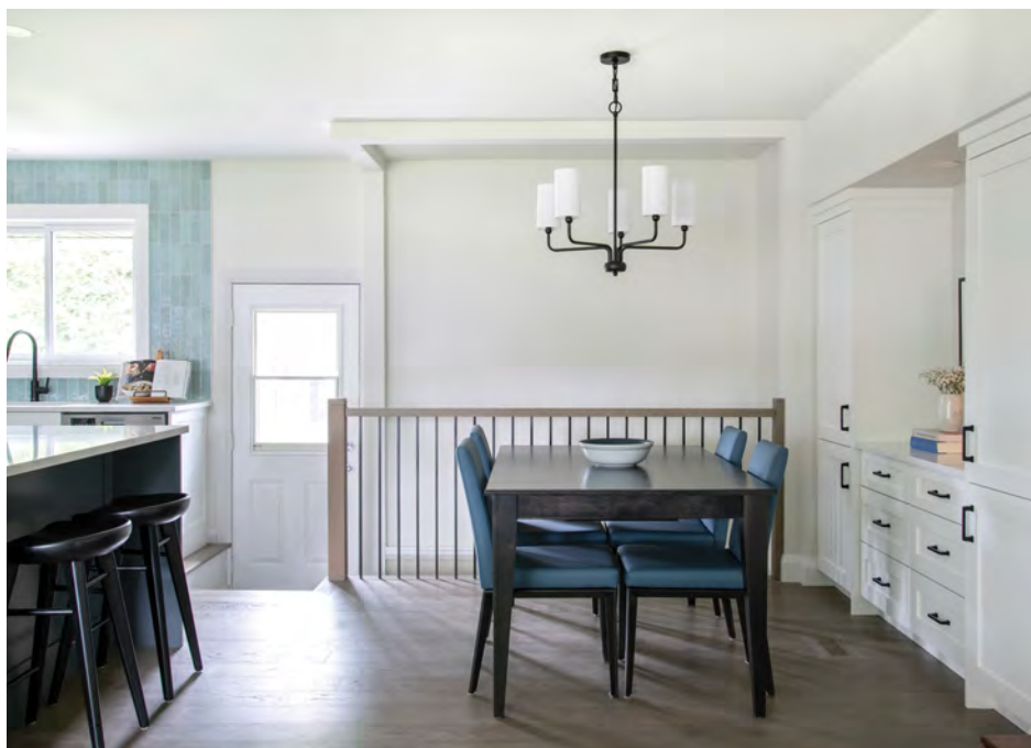
ABOVE: This light-filled kitchen offers ample storage space and room for cooking and hanging out. ABOVE RIGHT: A cleverly designed island maximizes hidden storage while also serving as an eating space. BELOW RIGHT: An expandable table offers homeowners an easy space-saving solution, while also providing extra space for entertaining.