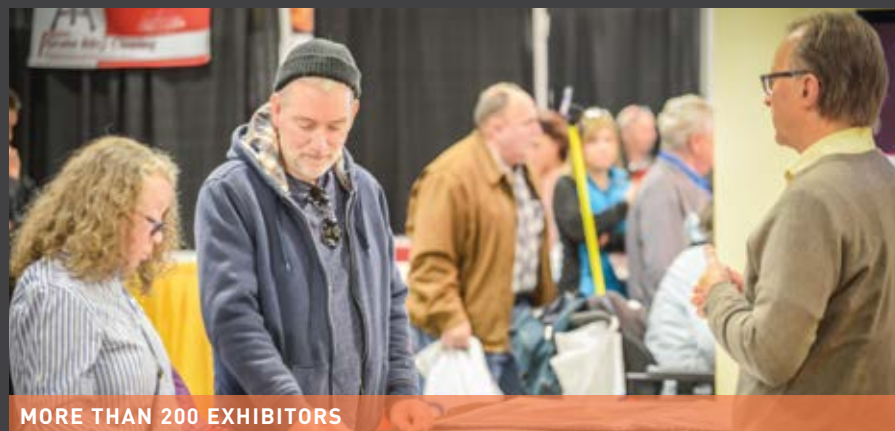
MORE THAN 200 EXHIBITORS

SAVE $4 BUY TICKETS ONLINE PROMO CODE: OURHOME *ON REGULAR ADULT ADMISSION